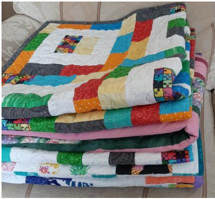
Comfort quilts collected at March Meeting