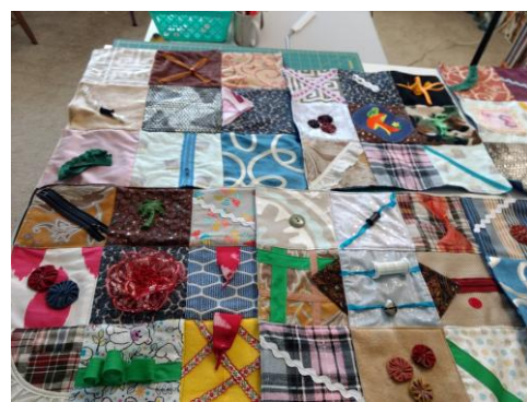
Fidget Quilts made at workshop