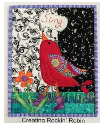
Creating Rockin' Robin

Date: Saturday, April 26, 2025 Time: 9:30 am to 3 pm Place: Good Shepherd Lutheran Church Price: $25.00 includes the price of the kit Project: This is a small bird appliqué wall hanging, shown. Kit will be provided. This workshop is limited to 15 members. Lunch: Please bring your own lunch.