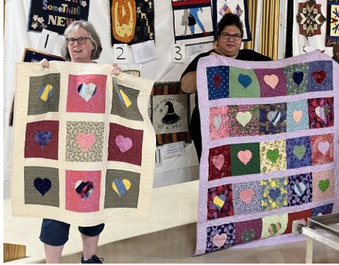
Comfort Quilts from Member Heart Blocks