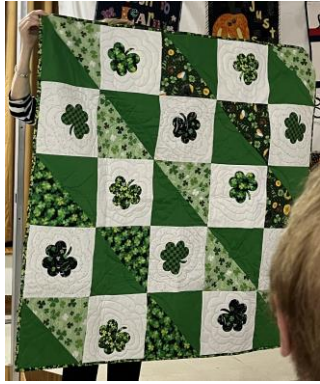
Cathy Fennell's 2025 BOM Example