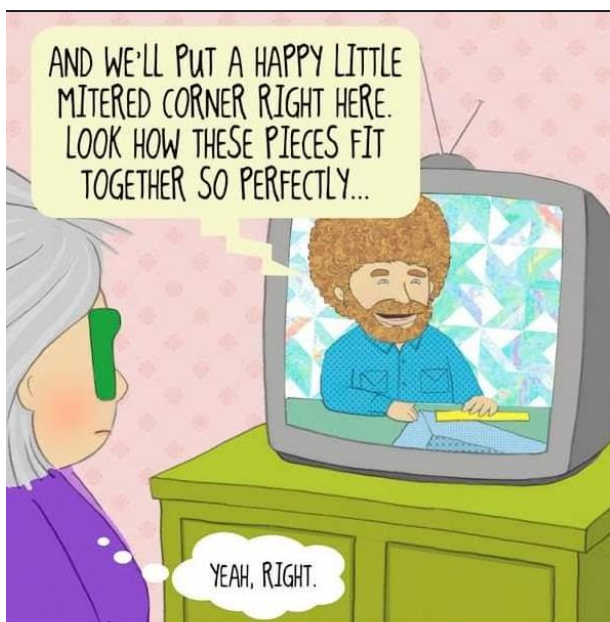
Quilting with Bob Ross.