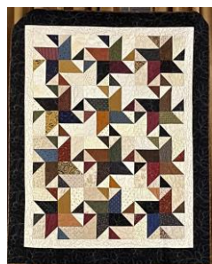
Beth's Finished Quilt