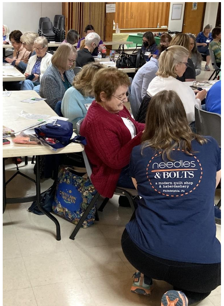
Members working on their Sashiko projects.