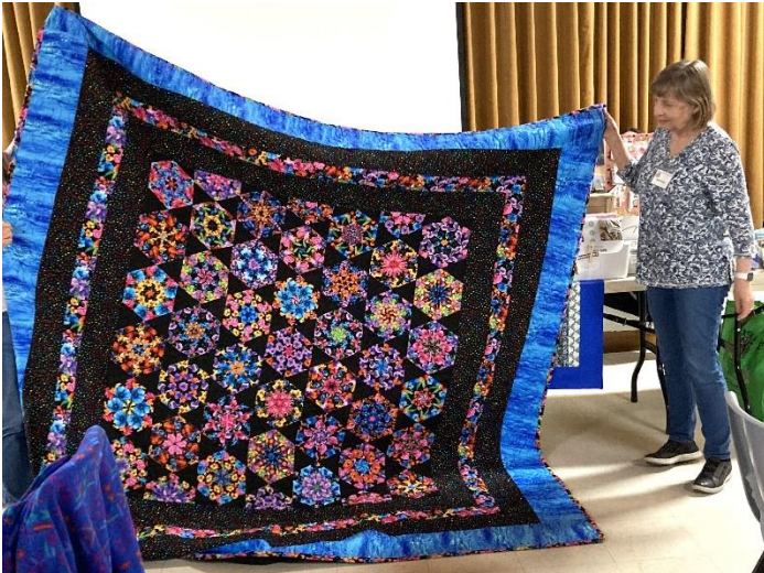
One Block Wonder Workshop – Donna Sneed