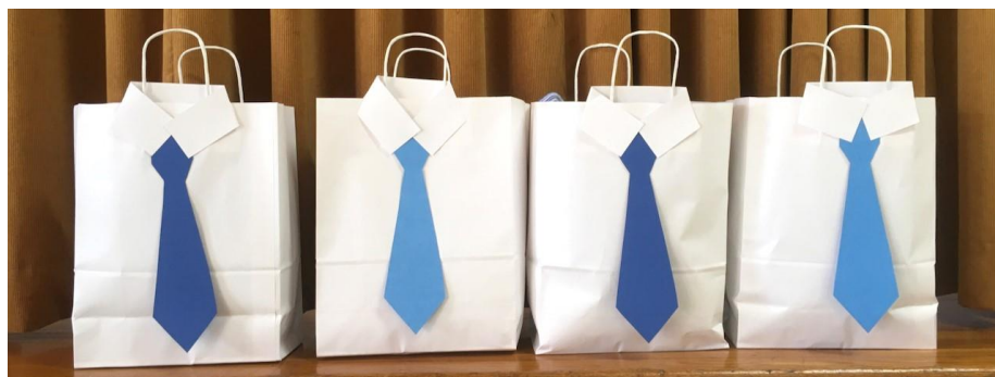
Dignity Bib Kits ready to go