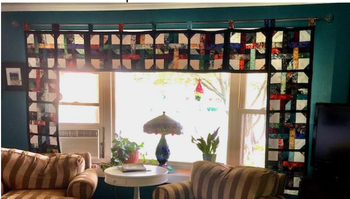
These curtains began as a quilt but Marcy Mancini decided to use the blocks as a window treatment.