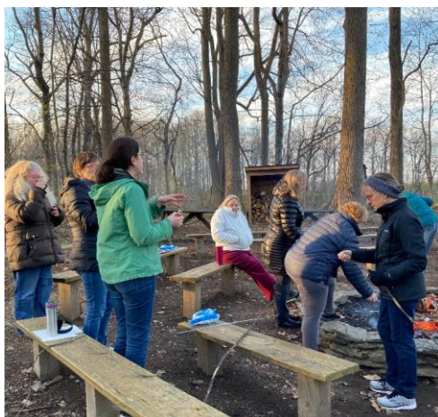
First we had our campfire and s'mores