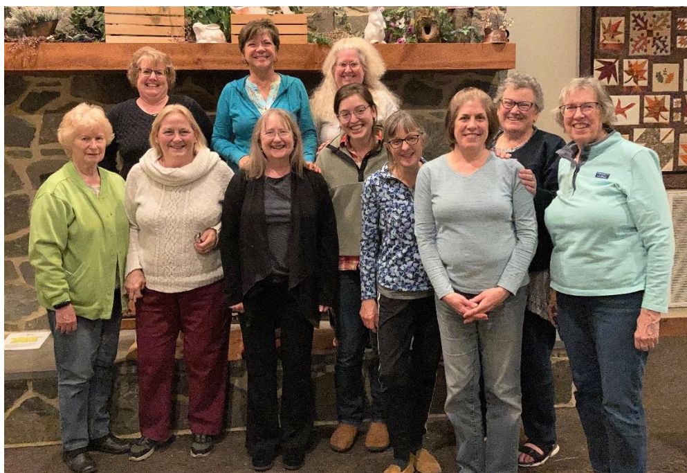
Group photo in the lobby by the big fireplace