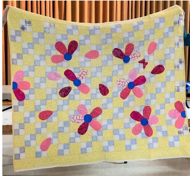
Sue Gustafson repaired a coworker's old quilt with appliqué over the holes and it will be used for story time at their library.