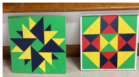
Barn Quilt Projects