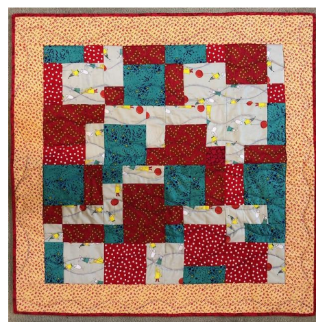
Molly Lorenz - Comfort Quilt