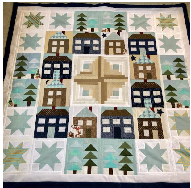
BOM Quilt Top completed by Molly Lorenz

Presser feet and the needle plate can cause problems. Plastic feet have a different pressure on the fabric that can create problems. The needle plate is like the bobbin – nicks can catch your fabric as you sew. Nicks and dings on the front of the plate? You might be sewing over pins. On the back of the plate? You might be pulling your fabric.