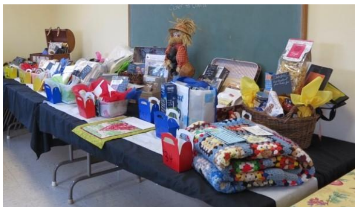
Some of the many prizes at the Chinese Auction