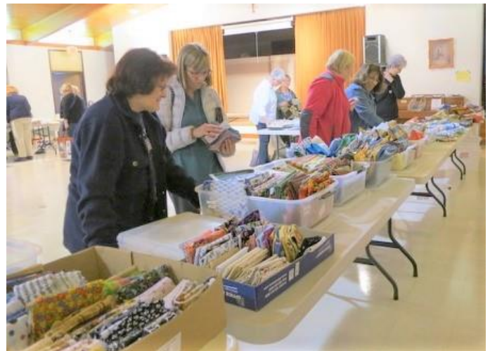
Fabulous fabric sale