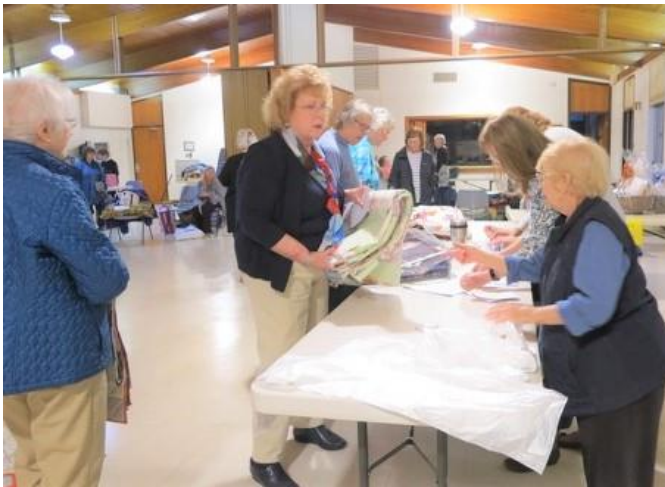
Taking in member's quilts for the show