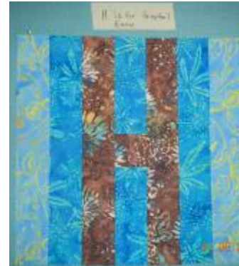
H is for Hospital