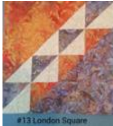
London Square, medium