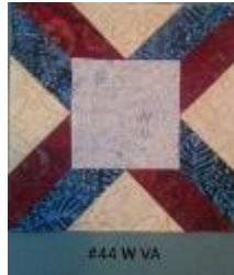
West Virginia, difficult