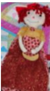
Sweet Meadows Farm Annie's Cat Bag holder Doll