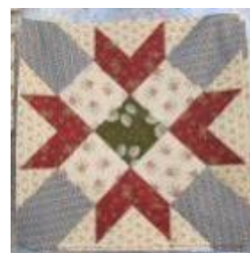
June Mrs. Roosevelt's Favorite