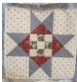
May Dolley Madison Star