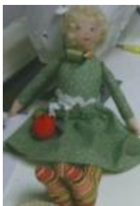
Blume pattern free