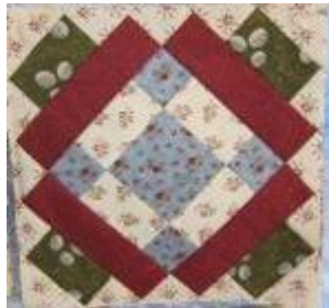
July Lincoln Block