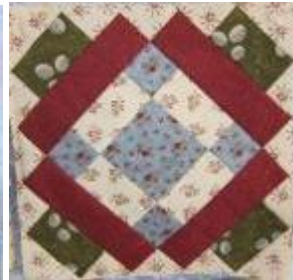
July Lincoln Block