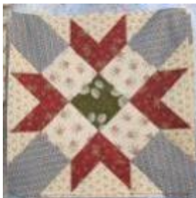
June Mrs. Roosevelt's Favorite