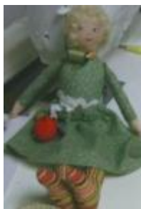
Blume pattern free