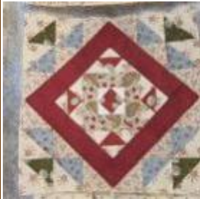
April Mrs. Cleveland's Choice