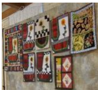
Members' August block of the month!