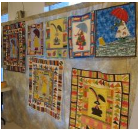
Members' April block of the month!