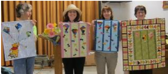
Members' March block of the month!