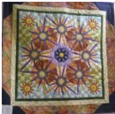
1 st Place: Becky Weiland