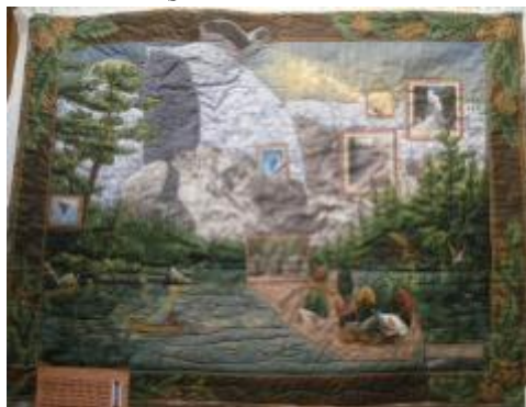
2 nd place: Sandra Dounce