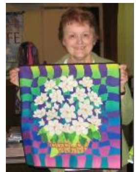
Quilts from the Anna Faustino Basket workshop