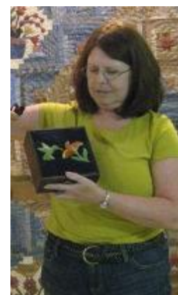
Candy's project from the first Wool Appliqué bee.