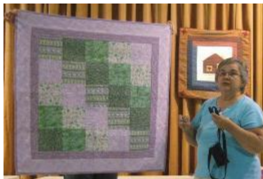
More lovely show-n-tell!