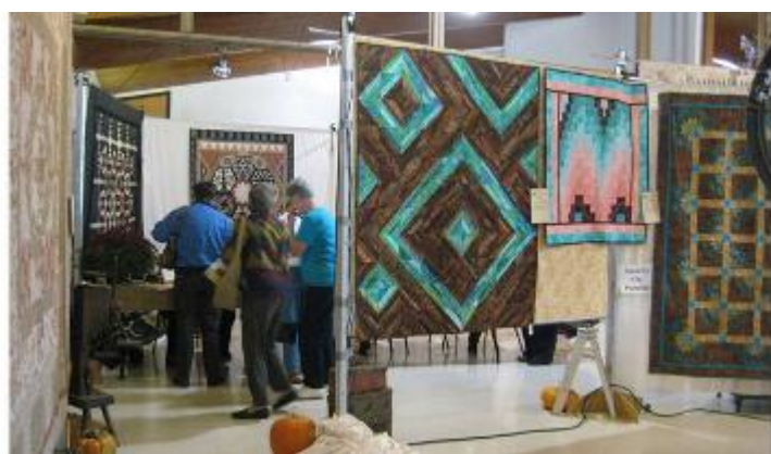
Entering the show.