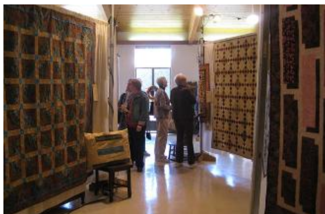
Viewing the quilts.