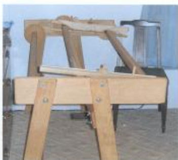
about 38 x 54 inches - crib size set up