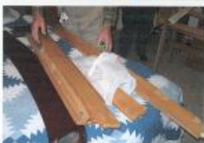
wood pieces to make other sizes